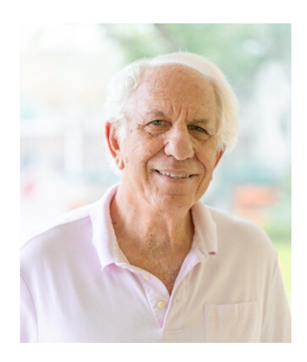
Dear Pre-Health Students,

The University of Miami (UM) provides an ideal environment to nurture your preprofessional development. As an undergraduate, you will make important decisions about your major, campus involvement, community activities, research, and application to professional school. The staff in the Pre-Health Office will work with you every step of the way for a smooth transition into a health professional school.